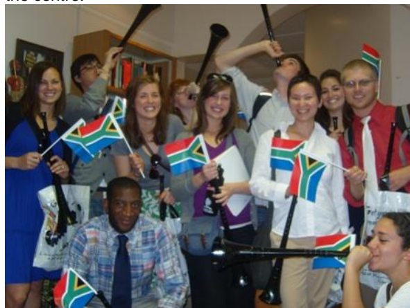
Drake University Students with Their Vuzuzelas